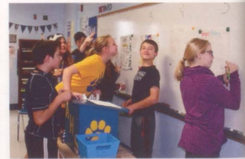
The 7th grade students take their time to vote on the best persuasive writing project in class.