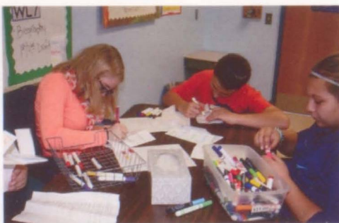
The 7th graders work hard on their poetry vocabulary, they create color coded flip-grams to help them study for their poetry unit test.